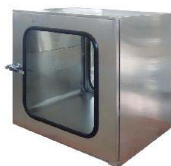
← Complete SS construction