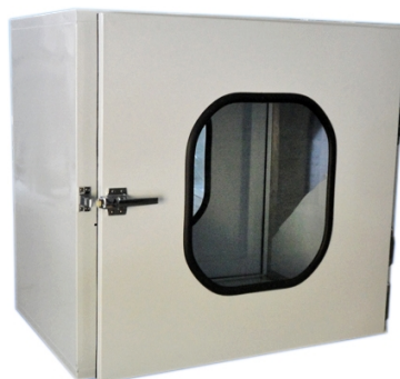
← Coated Iron sheet & SS inside construction